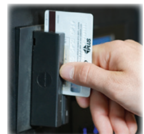
Mag Stripe Reader

NOTE: Models with coils can be easily changed as required for vending different size products.