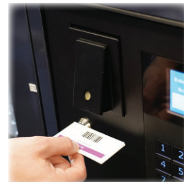
Bar Code ID Scanner

Users can access medical kits using a variety of access methods including: RFID badge, magnetic strip, Proximity card reader, barcode, personal PIN, Biometrics, credit card reader (retail applications) and more.