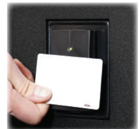
Proximity Card Reader