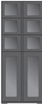
SL8 Locker Satellite Shown With Window Doors RA-2