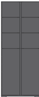
SL8 Locker Satellite Shown With Solid Doors RA-2