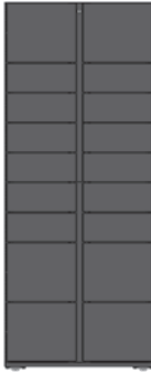
SL18 Locker Satellite Shown With Solid Doors RA-5