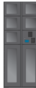
SL7 Locker Shown With Window Doors RA-2