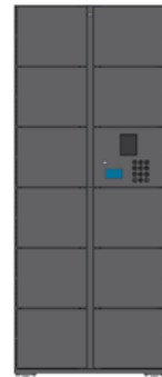
SL11 Stand Alone Locker Shown With Solid Doors RA-3