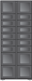
SL18 Locker Satellite Shown With Window Doors RA-5