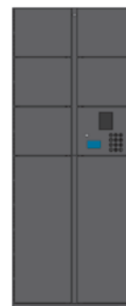
SL7 Locker Shown With Solid Doors RA-2

The SL16 locker adds smaller individual compartments for greater capacity of small product types.