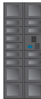
SL16 Locker Shown With Window Doors RA-5