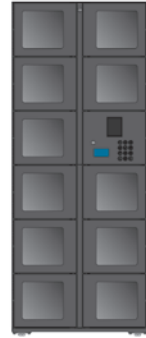
SL 11 Stand Alone Locker Shown With Window Doors RA - 3

The SL11 can also be used for secure asset management in the form of will-call, redemption and storage of high-dollar items or user-specific items that contain sensitive data such as laptops, tablets, and smartphones.