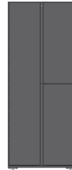
SL3 Locker Satellite Shown With Solid Doors RA-1