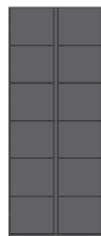
SL12 Satellite Locker Shown With Solid Doors RA-3