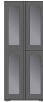
SL 3 Locker Satellite Shown With Window Doors RA-1