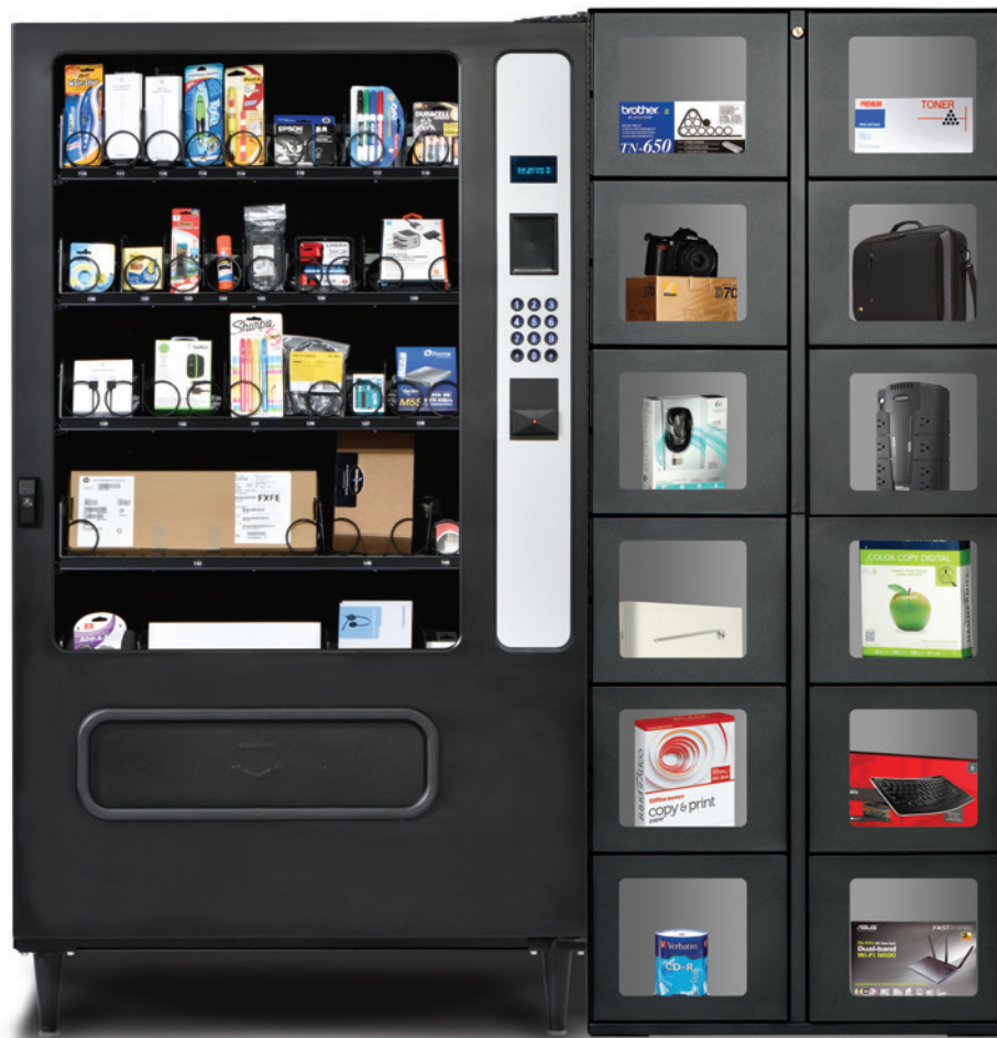
SD5000 Supply Dispenser