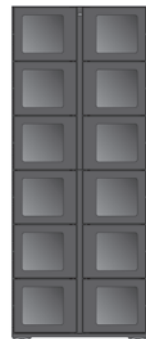
SL12 Satellite Locker Shown With Window Doors RA - 3

The SL12 satellite locker is a is the perfect expansion to your dispenser or locker. Adding capacity and versatility to your system.