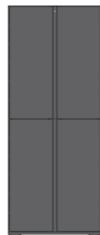
SL4 Locker Satellite Shown With Solid Doors RA-1