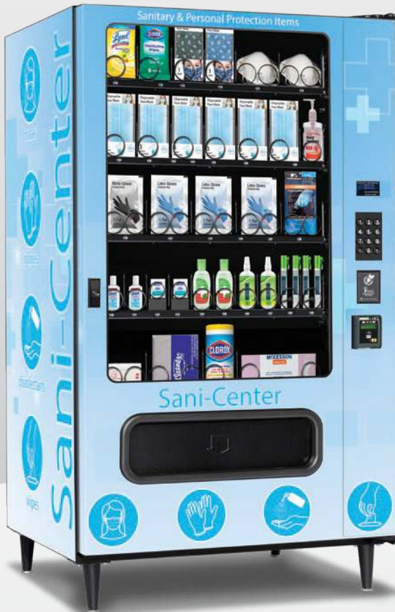
Sani-Center Plus PPE

Provide consumers with safe and easy access to personal protection equipment (PPE), safety products, medical supplies, and disinfecting supplies with the Sani-Center PPE Vending Machine.