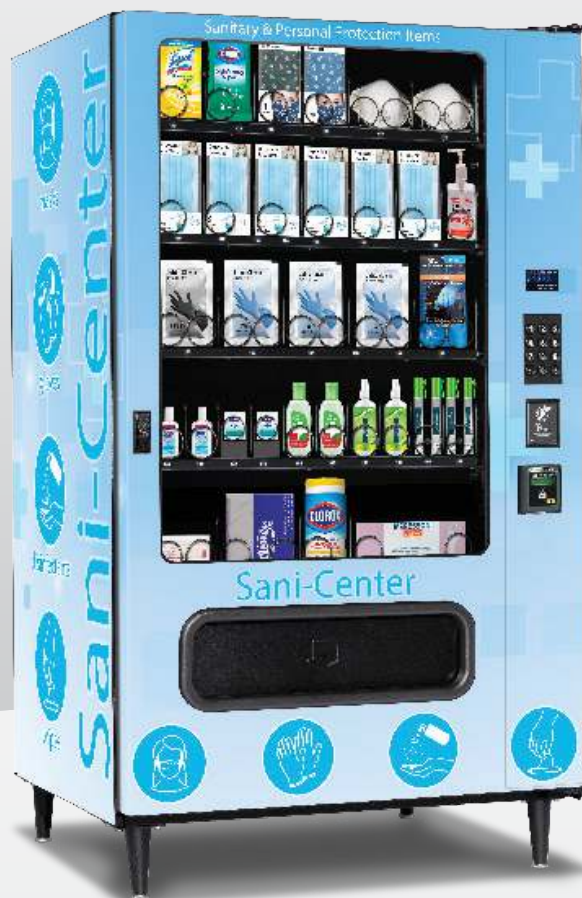
Sani-Center Plus PPE

Provide consumers with safe and easy access to personal protection equipment (PPE), safety products, medical supplies, and disinfecting supplies with the Sani-Center PPE Vending Machine.